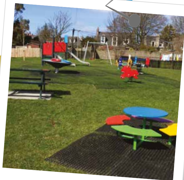
Pleasing play areas created by phase one of the 'Backies' project